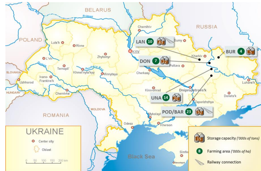
AgroGeneration. Map of Operations