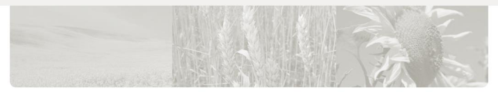
AgroGeneration. Corporate Office in Kharkiv