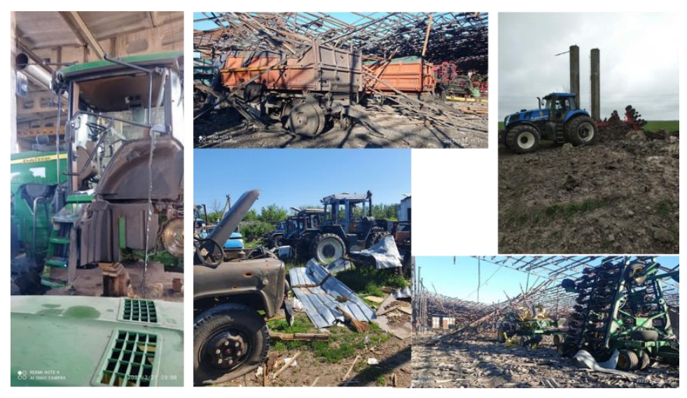
AgroGeneration. Examples of Group Farms' Machinery and Equipment Damaged

and infrastructure, located in areas controlled by Ukraine, in the zone of active military activities and 30-40 km beyond it, took place to the date.