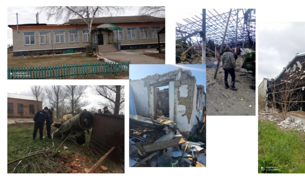
AgroGeneration. Examples of Group Farms' Infrastructure Damaged

Still, for the moment it is impossible to evaluate accurately the amount and value of total damages and losses of machinery fleet (including spare parts) and infrastructure due to limited access to the farms on the back of regular shelling. According to the Group's internal preliminary estimates, the book value of considered to be lost machinery came to around 6M USD. Replacement value of mentioned assets may come to over 20M USD.