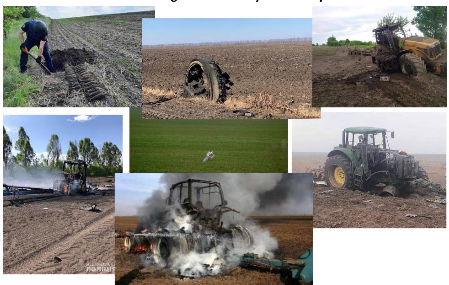
Ukrainian Agriculture Today. Life Safety Risks in the Ukrainian Fields are Very High

AgroGeneration continues to undertake all steps necessary to ensure a full scope of operations, which can be resumed once the situation stabilizes or improves. For the moment, the war is ongoing in Ukraine and, in particular, intense military activities are held on the territory, where AgroGeneration's assets are located, thus new challenges in the course of coming harvesting campaign are to be faced.